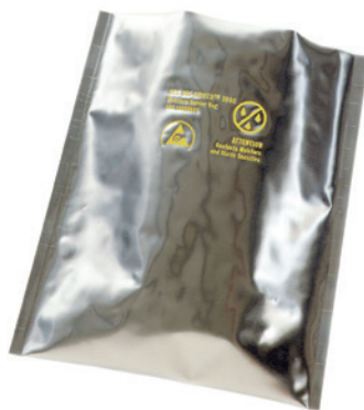
3M™ Moisture Barrier Bag Dri-Shield 3000

These bags are tested to meet or exceed certain electrical and physical requirements of Moisture Barrier Bags, ANSI/ESD S541, and to be ANSI/ESD S20.20 program compliant. Bags are RoHS Compliant* and lead-free**.