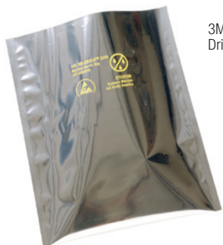
3M™ Moisture Barrier Bag Dri-Shield 2700

These bags are tested to meet or exceed certain electrical and physical requirements of ANSI/ESD S541, and to be ANSI/ESD S20.20 program compliant. Bags are RoHS Compliant* and lead-free**.