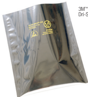
3M™ Moisture Barrier Bag Dri-Shield 2000

These bags are tested to meet or exceed certain electrical and physical requirements of ANSI/ESD S541, and to be ANSI/ESD S20.20 program compliant. Bags are RoHS Compliant* and lead-free**.