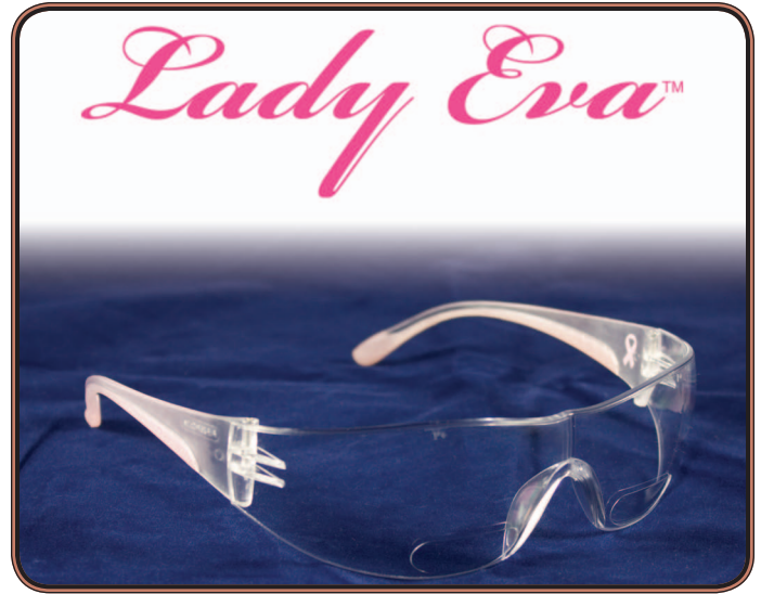
Polycarbonate lenses block 99.9% of the sun's ultraviolet rays. This ultraviolet protection has already been incorporated within the lens material when the lenses are being produced.

Country of Origin/Harmonization Code: Taiwan/9004.90.0000