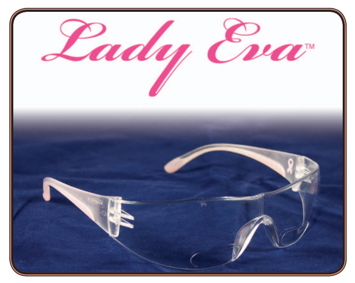
Polycarbonate lenses block 99.9% of the sun's ultraviolet rays. This ultraviolet protection has already been incorporated within the lens material when the lenses are being produced.

Packaging: 12 units per dozen, 144 units per case Case Dimensions (cm): 65 x 30 x 33 / (in): 25.6 x 11.8 x 13.0 Case Weight: 13.4 lbs / 6.1 kg Manufacturer Certifications: ISO 9001:2000 certified Country of Origin/Harmonization Code: Taiwan/9004.90.0000